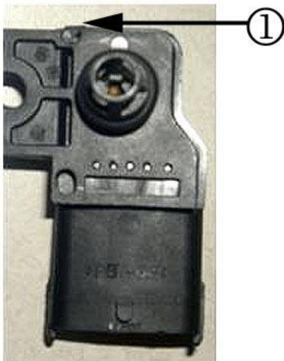
Fig. 3: View Of TMAP Sensor

The TMAP sensor after the boss was removed (1).