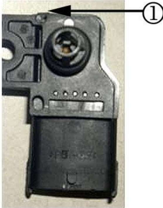
Fig. 3: View Of TMAP Sensor

The TMAP sensor after the boss was removed (1).