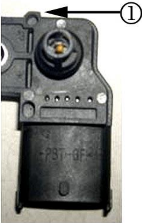
Fig. 2: Identifying Boss